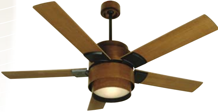
Teak Silo with 56" Custom Silo Teak Blades

Model-Finish SI56TK Blade-Finish Included Light-Finish Integrated