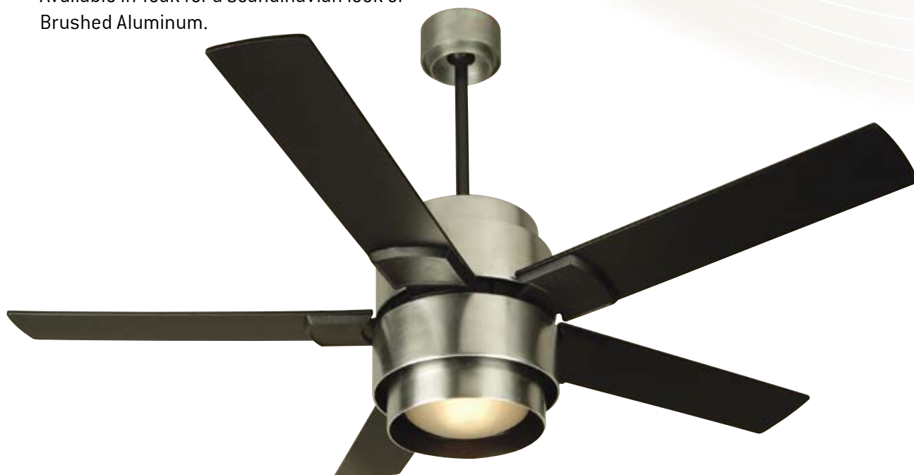
Brushed Aluminum Silo with 56" Custom Silo Black Blades

The Silo has exceptional air movement, unique contemporary styling, and lasting quality. Available in Teak for a Scandinavian look or Brushed Aluminum.