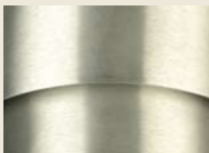
BA Brushed Aluminum