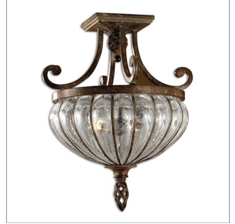
GALEANA, 2 LT SEMI FLUSH MOUNT