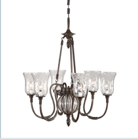
GALEANA, 6-LT CHANDELIER