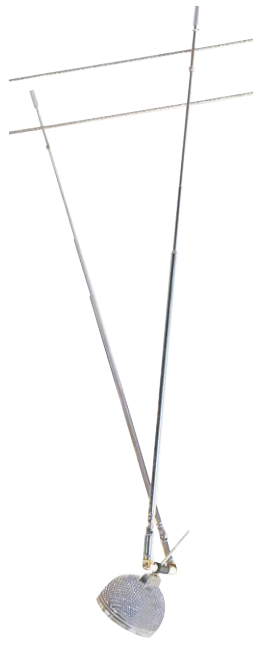
K-TELESCOPE WITH MESH BACKLIGHT SHIELD ACCESSORY Shown approximately 20% actual size.