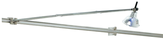
Shown approximately 20% actual size.